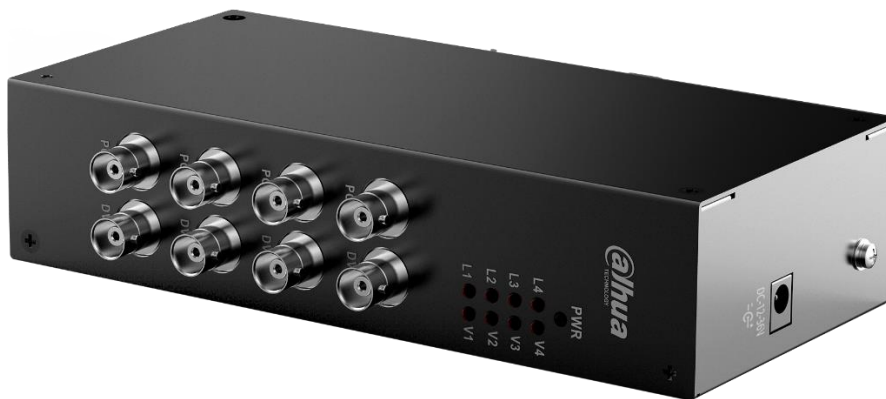
DH-PFM811-4CH PSE End (Power sourcing equipment)