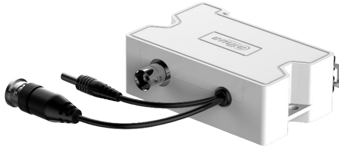
DH-PFM811-C PD End (Power device)