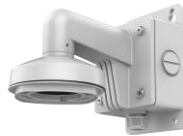
DS-1272ZJ-120B Wall Mount