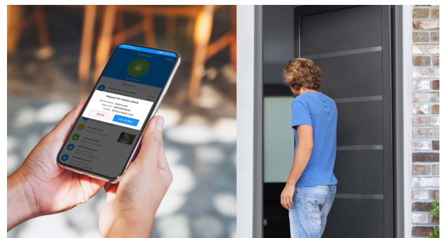
Remotely unlock using the app