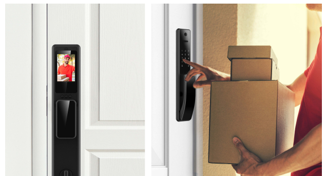
Real-time monitoring from the indoor