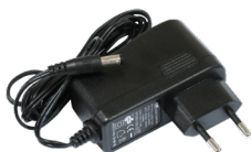
24 V 0.38 A power adapter