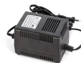
AC24V/3A Power Adapter