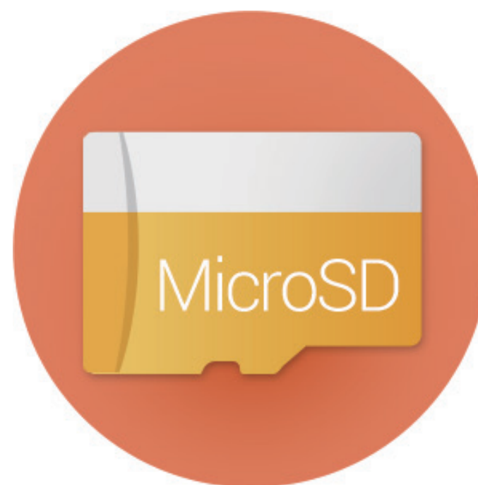
Supports MicroSD Card

Save your recordings with flexible and secured solutions. The DB1 comes with a built-in MicroSD card slot that can store up to 128 GB of recorded footage. You can also save your images to EZVIZ Cloud for additional back-up. (The EZVIZ CloudPlay is only available in the US, UK and Europe)